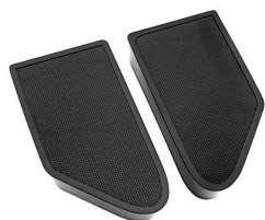
Exact Copy (≈50%)

a) Judgment that Schildmeier’s Pair of Bed Rail Stake Pocket Covers , as depicted below, and any colorable imitations thereof (examples shown) sold under any different name or affiliate infringe Schildmeier’s United States Patent No. D 816584 (the “584 Patent”);