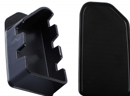
Slot side (≈20%)