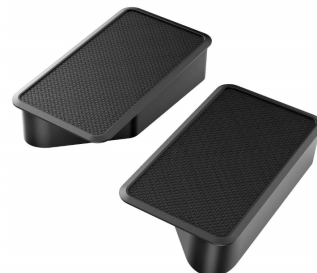
Squared Flange (≈10%)