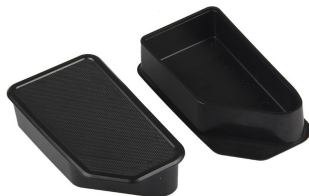
Wide Flange (≈ 20%)